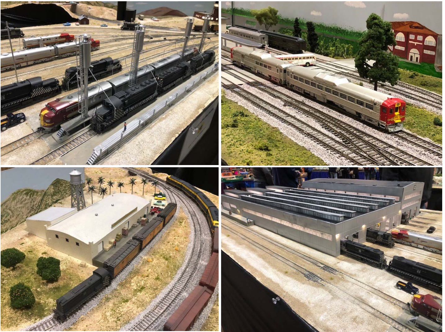
Scenes from the Santa Fe All the Way modular layout at the train show in St. Charles, MO in January 2022.