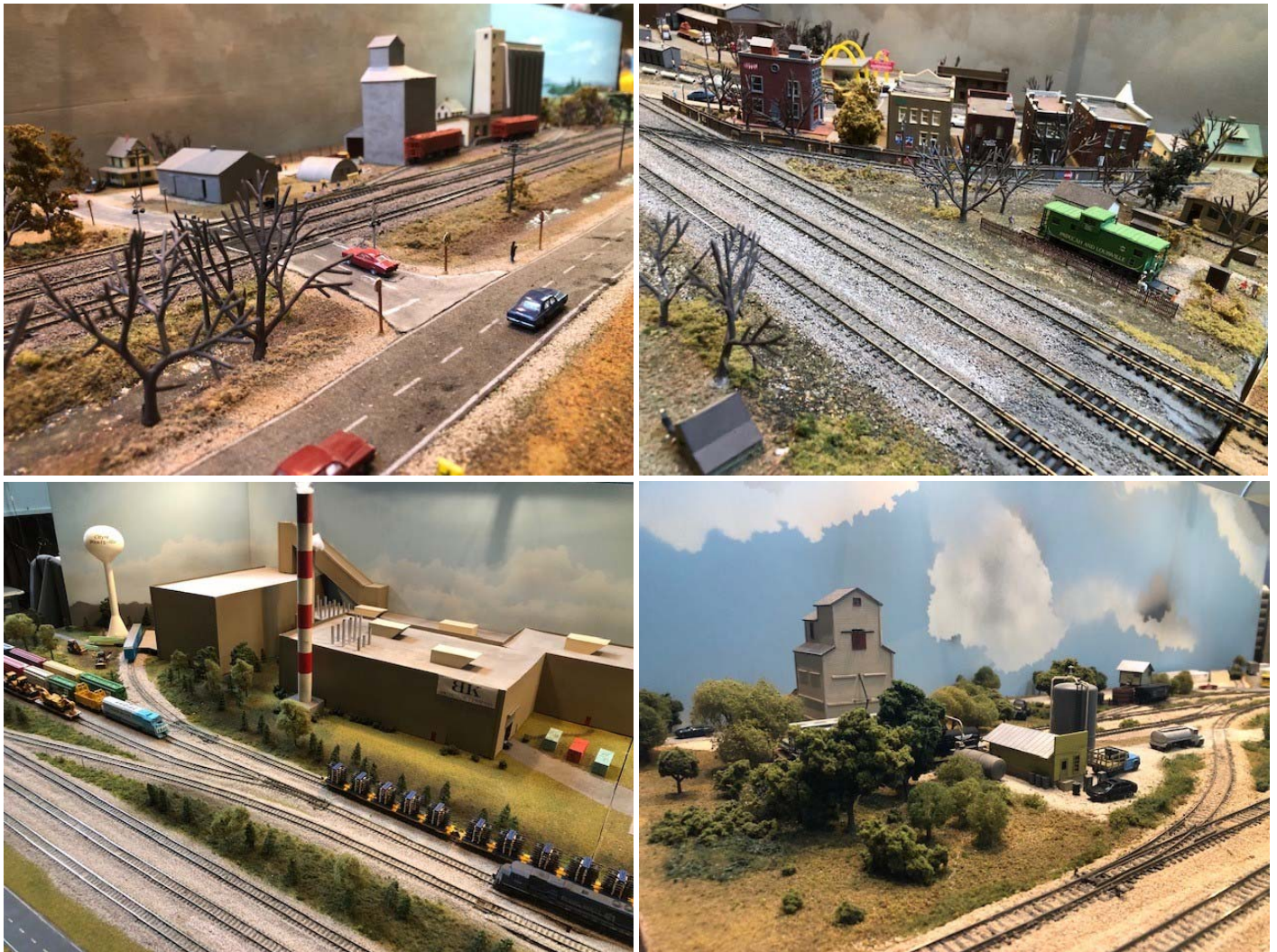
Scenes from the Mississippi Valley N Scalers modular layout at the train show in St. Charles, MO in January 2022.

Respectfully Submitted, Jeff Cooper Clerk