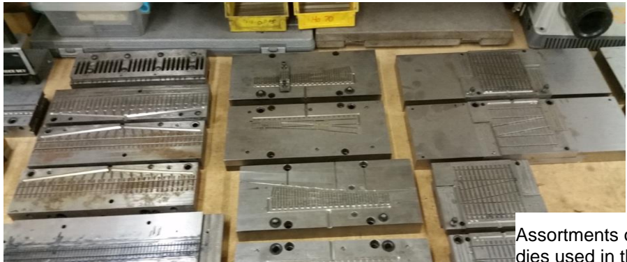
Assortments of dies used in the manufacturing process.