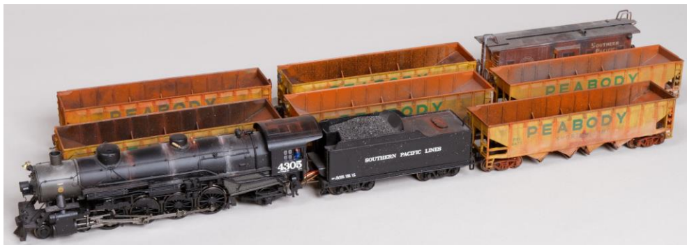
1 st Place (tie) Whole Train: B&O Train, Jack Stroker