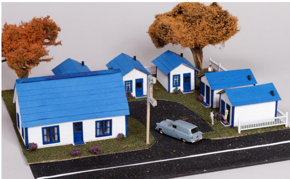
3 rd Place Off-Line Structure: Motel, Greg Gramlich