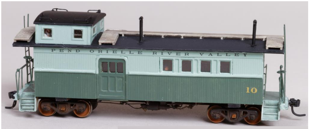
1 st Place Caboose: PORV #10, Dave Roeder