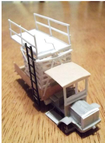
Model prior to painting.

smaller straight brackets and attached two of these brackets to the ends of each running board. I then affixed the running boards and fenders to the frame after removing the mount for the large tool box. I added pieces of strip styrene to the fenders to match the photograph. I added the control panel, gear shift, steering wheel, and cowl supports next, followed by the steering rod, brake rods, and muffler. Next I added a pair of pieces of styrene tubing to the passenger side of the frame to simulate the winches in the picture. I also assembled the tool