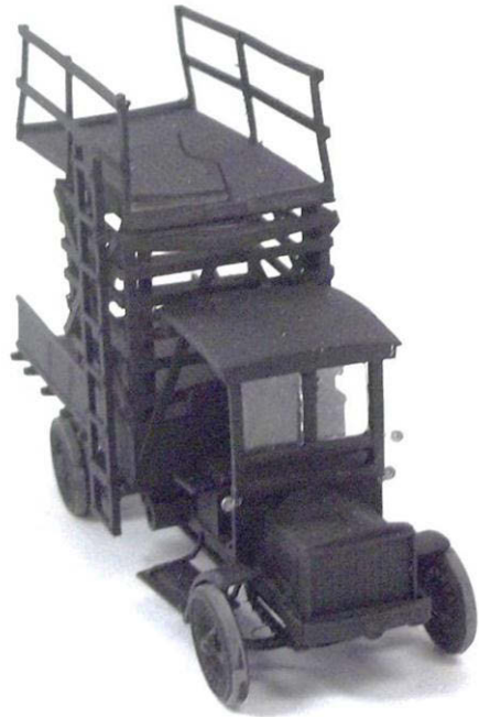
Finished model less additional details.

I fabricated a windshield frame from styrene and attached it to the cowl. I then added the roof to the top of the frame. Lastly I attached the bed to the back of the truck frame and the back of