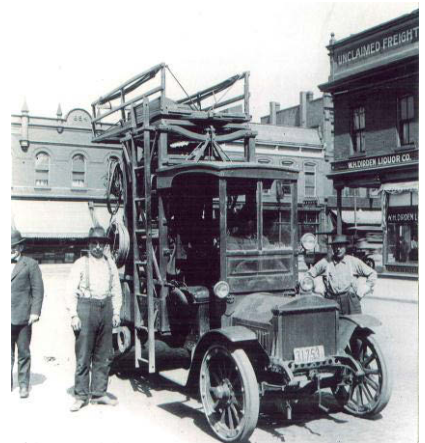
The prototype line truck.

I model the East St. Louis & Suburban Railway companies as they would have appeared had they survived into the 1950's. As a result street cars, interurban cars, and steeple cabs dominate my roster of motive power. Another aspect that makes interurban systems stand apart from steam roads stems from the types of maintenance of way equipment in use. The most notable piece of maintenance equipment peculiar to interurbans is the line car, which allows men to work on the overhead wires used by most interurban systems to provide power to the cars.