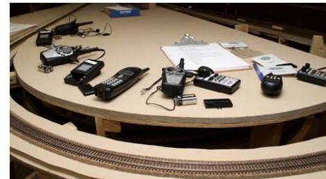
A sampling of the electronics needed to keep this 1500 square foot layout running and the dozen or so operators informed of one another's movements..