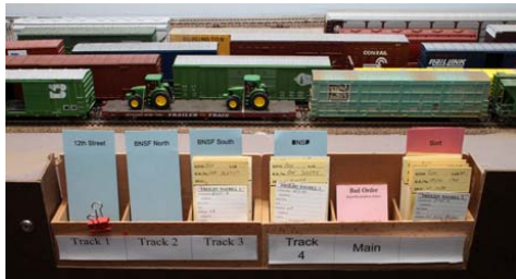
Paperwork – don't leave the yard without it