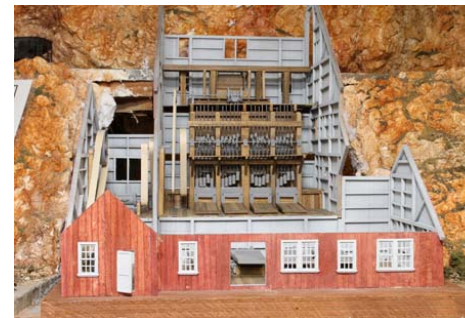
A close-up of Randy's stamp mill