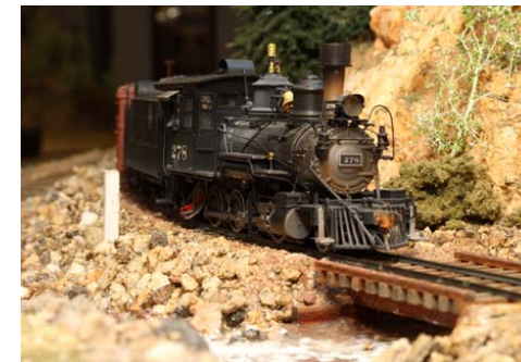
The operator's eye view of his engine