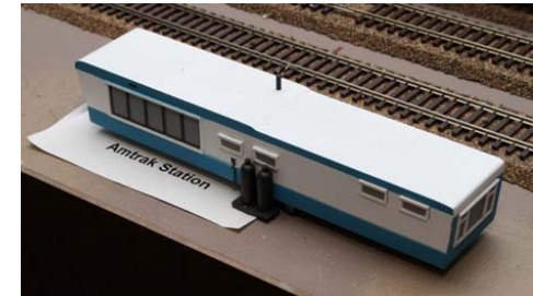
Prototypical realism, circa 1995.