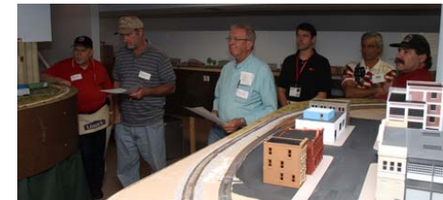
A portion of the crew getting their introduction to the St. Louis Junction Railroad and the numerous trains they'll be running for the next three hours.