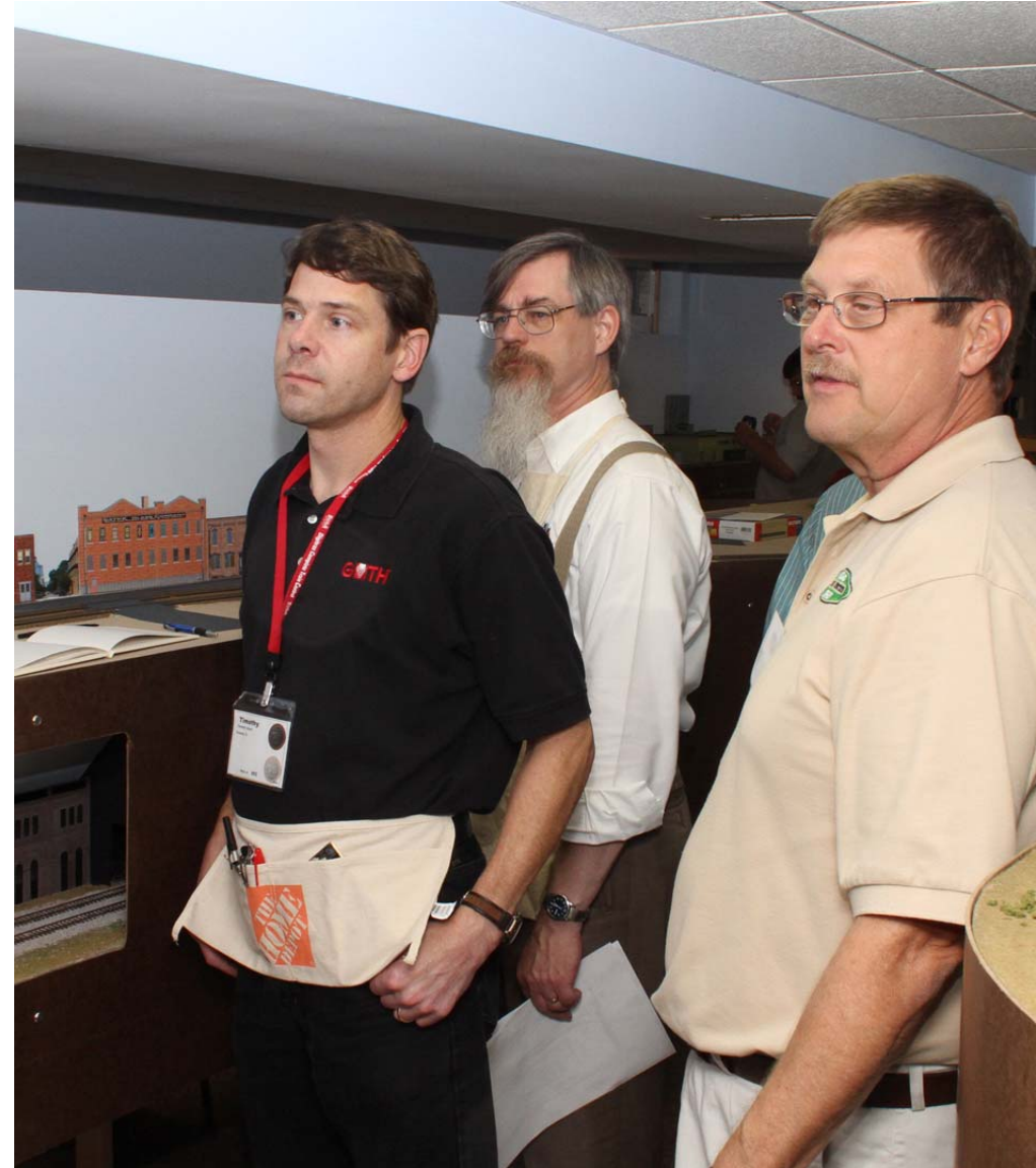
Gateway Division Rail Op Weekend 2010