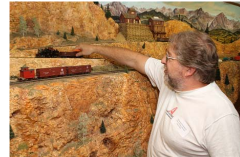
Sometimes a bit of re-railing is necessary