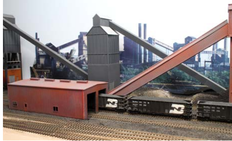
Some of the heavy industry served by the road