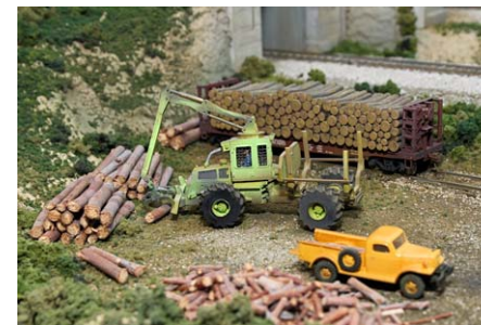
Litchfield