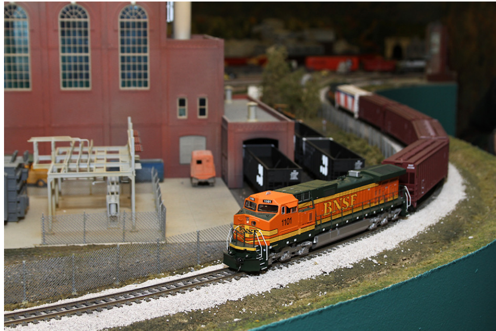
Many more photos are available on our website: www.gatewaynmra.org