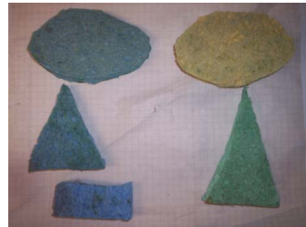
Sponges cut into tree foliage shapes

money on them. I proceeded to cut "tree" shapes out of them. I only cut out the foliage shape, saving the scraps for use in stamping the trunks. I cut two versions of evergreen, triangles really, and two ellipsoid shapes for deciduous trees. These shapes need not be either perfectly symmetrical or perfectly neat. The profiles of real trees in nature rarely fit in either category.