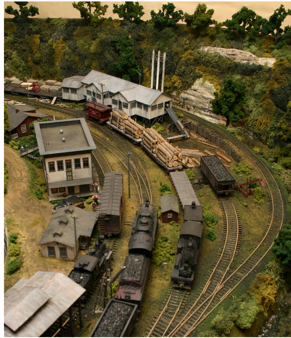
2008 Fall Meet

Official Publication of the Gateway Division NMRA