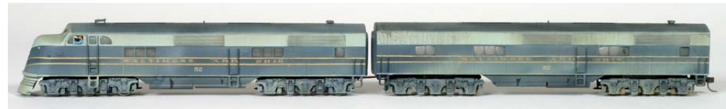
First Place, Diesel Locomotives: Phil Bonzon – B&O E1