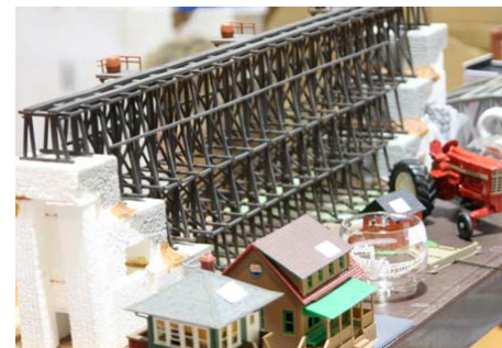
Merchandise for sale