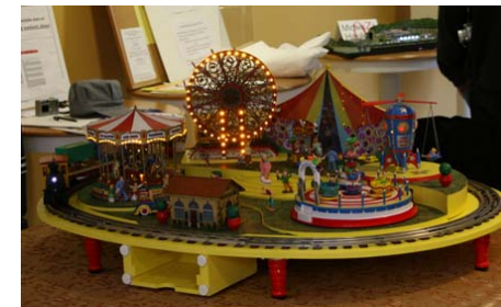
A circus-themed display layout