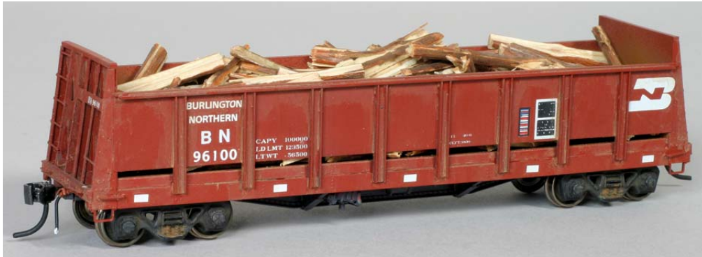
First Place, Freight Cars: Dave Roeder, MMR – Burlington Northern Pulpwood Car