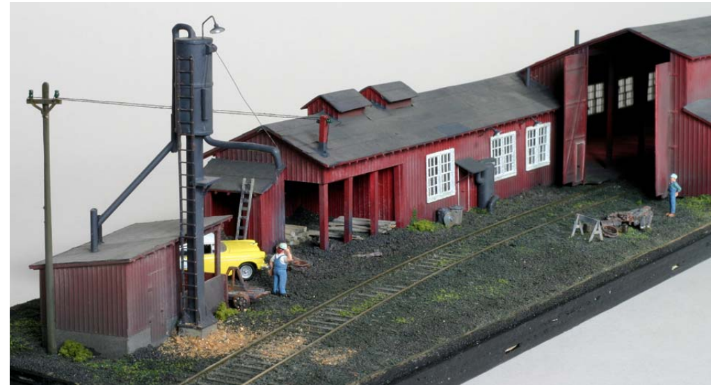
First Place, Online Structures: Phil Bonzon – Wood Engine House