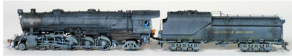
First Place, Steam Locomotives: Phil Bonzon – B&O 4-8-2