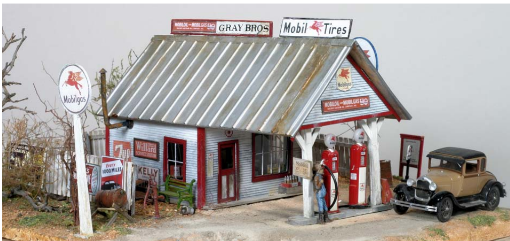
First Place, Offline Structures: Greg Gray – Gray Bros. Mobil Station Best in Show