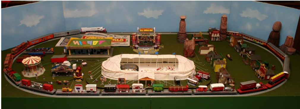
Another, larger circus themed display layout