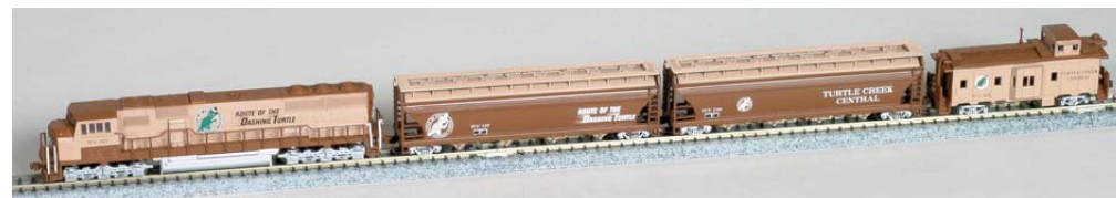
First Place, Whole Train: Dave Roeder, MMR