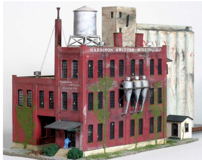
First Place, Online Structures: John Carty Best in Show