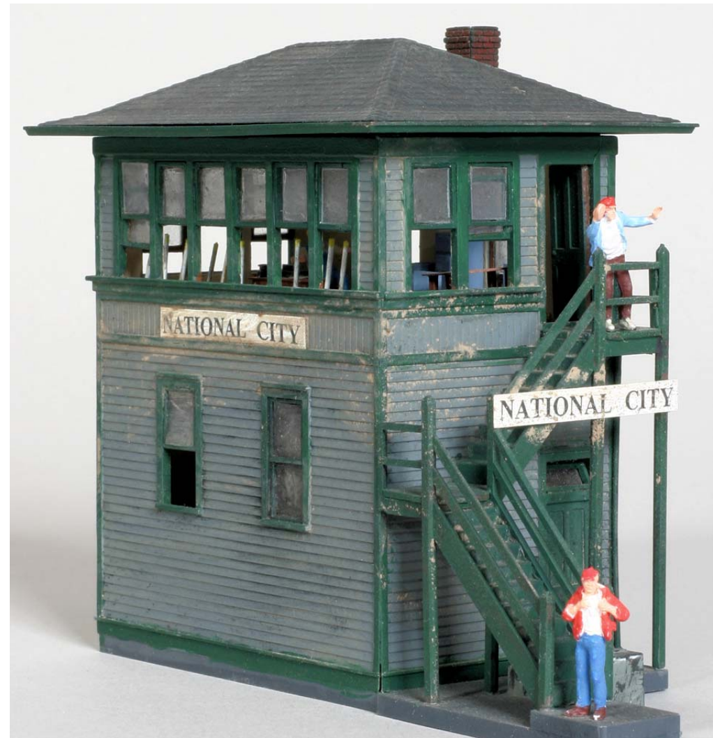
2007 Fall Meet Contest Winners