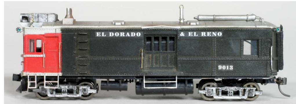
First Place, Diesel Locomotives: Jim Providenza