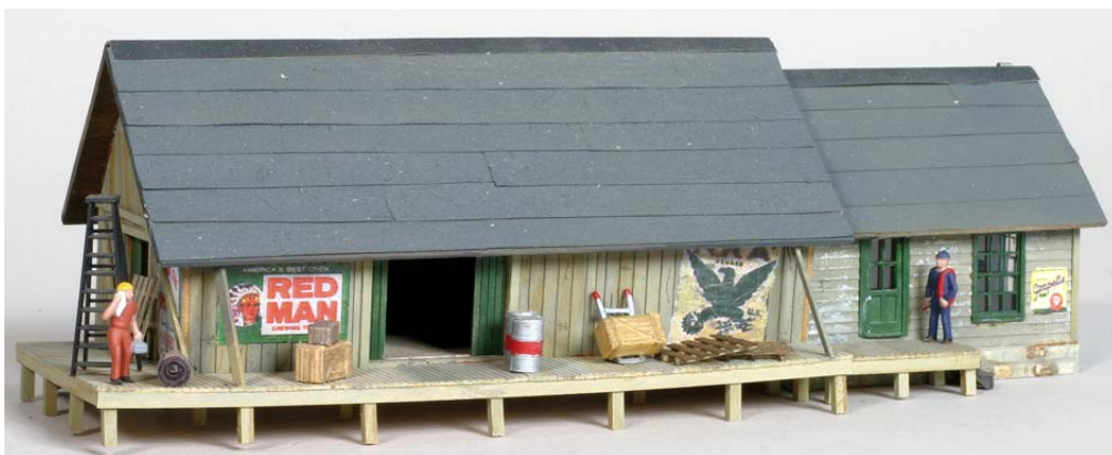
First Place, Offline Structures: Richard Lake