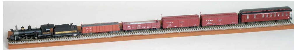
Second Place, Whole Train: Glen Koproske