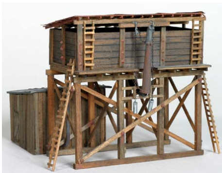
Second Place, Online Structures: Richard Lake