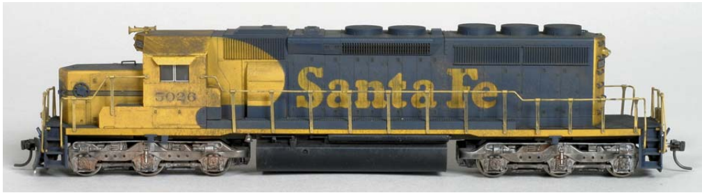
Second Place, Diesel Locomotives: Brian Post