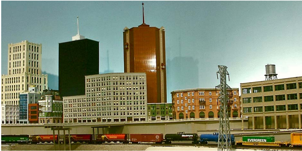
Jerry describes the MKP as running from Mound City -- 'a big city in eastern Missouri' -- to the Rockies'