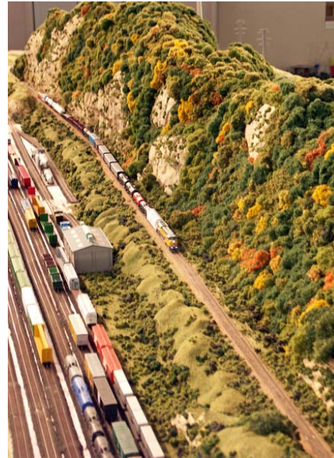
The mainline and yard are squeezed between Osage Ridge and the river.