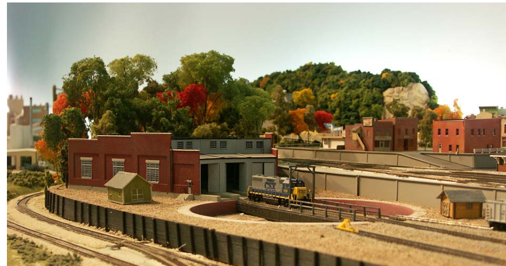
The turntable and roundhouse at Jefferson, at the east end of the MKP.