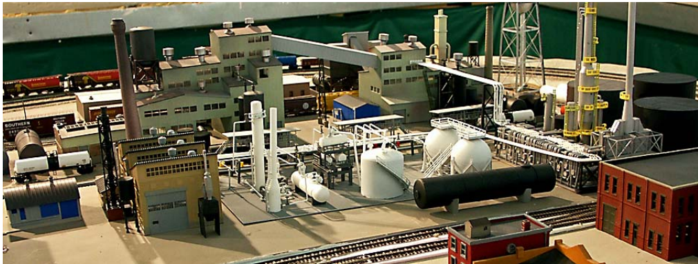
There are plenty of industries in Mound City to justify carloadings on the MKP.