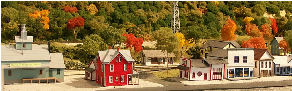
West of Mound City, the town of Anton looks a lot like Augusta.