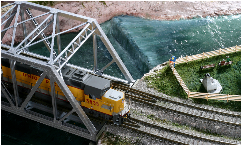
The waterfall just above the bridge proved to be a popular attraction for Prieser people and prototype people alike. Water is Enviro-Tex resin with a top-coat of Woodland Scenics Water Effects.