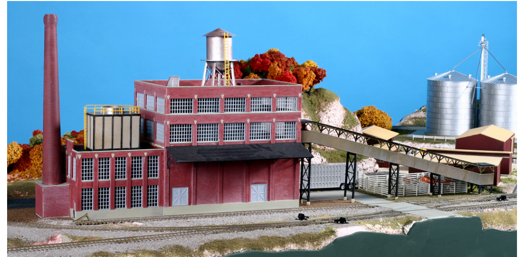
The kit originally comes with a loading dock along this side, but due to tight clearances the dock was omitted and the loading track runs right up against the building. The shed roof above the loading doors was raised to clear the tops of cars.