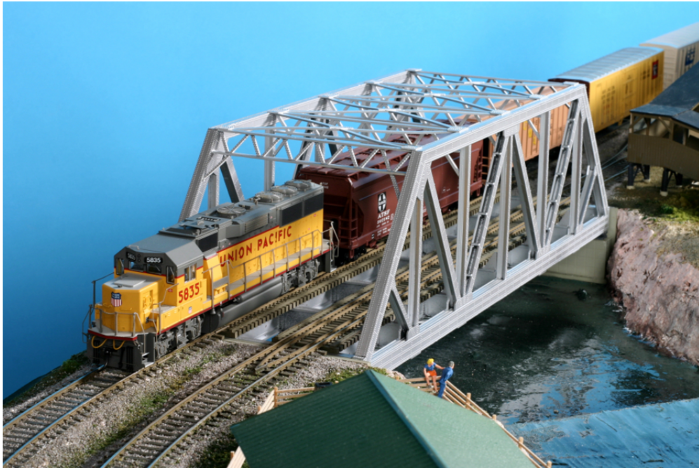
Just past the packing plant the mainline crosses a river.