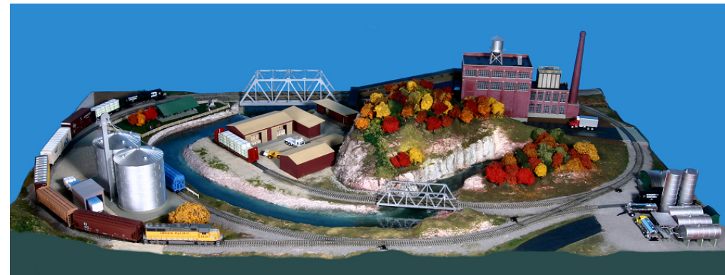
The layout seen from the opposite side.