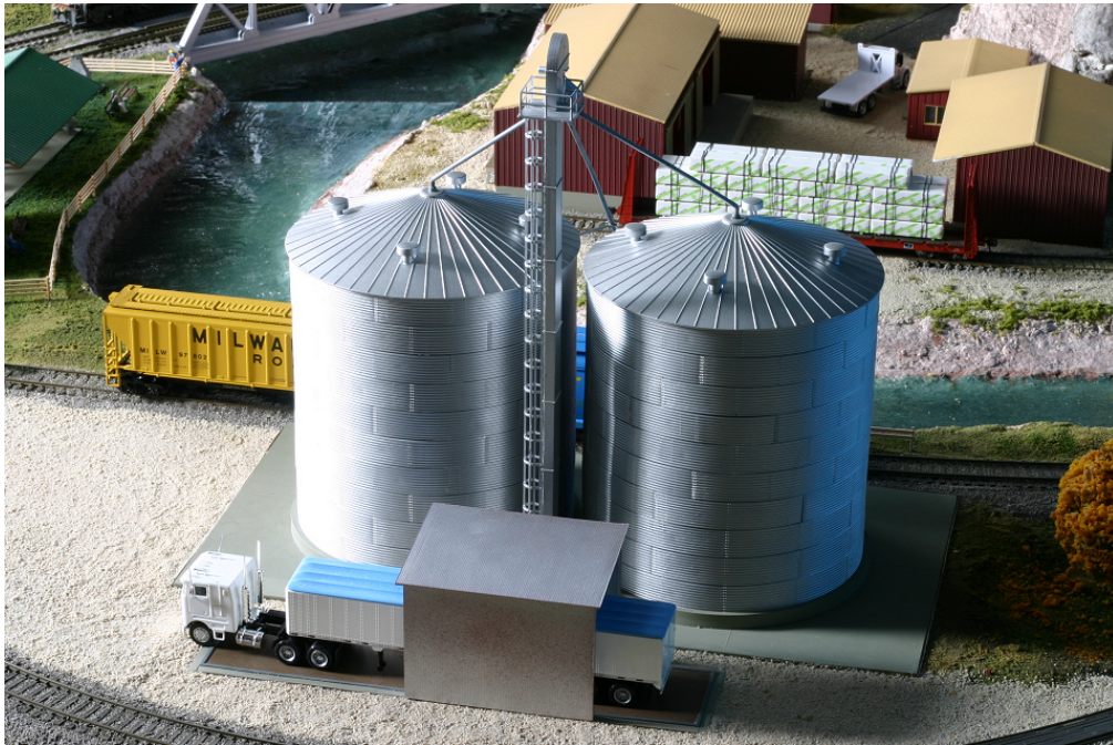
The next industry down the line is this modern grain elevator. Each of the two storage bins and the grain conveyor itself is a separate Walthers kit. The discharge shed was scratch-built.