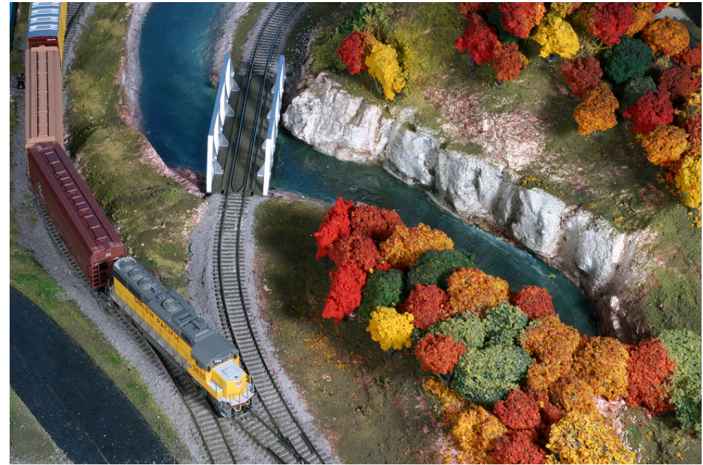
This trailing point industrial track leads across the river by way of an Atlas pony truss bridge to the lumber yard, another Walthers kit.