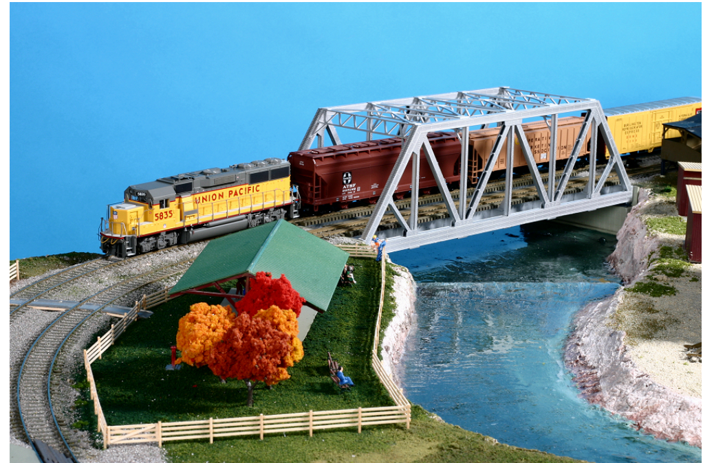
These photos show the true purpose of the picnic scene: filling a space on the layout where no rail-related industry could be shoe-horned.