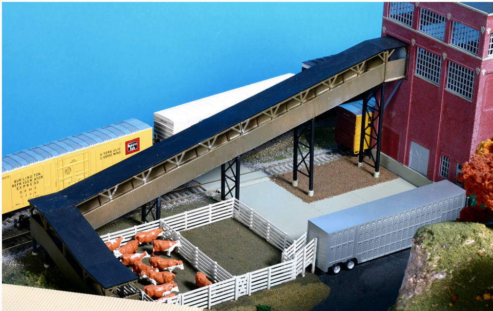
The supply side of the industry. The ramp was relocated from the original kit configuration to fit the available real estate.