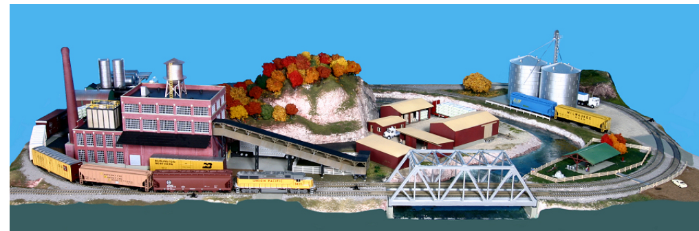
An overview of the GCXIII; this side was usually displayed as the 'front' of the layout at train shows.

At present, no one is willing to take the lead in building Gateway Central XIV, and so the membership at the October Division meeting voted to postpone construction of the next layout for a year, and then re-assess the availability of members willing to do the work.