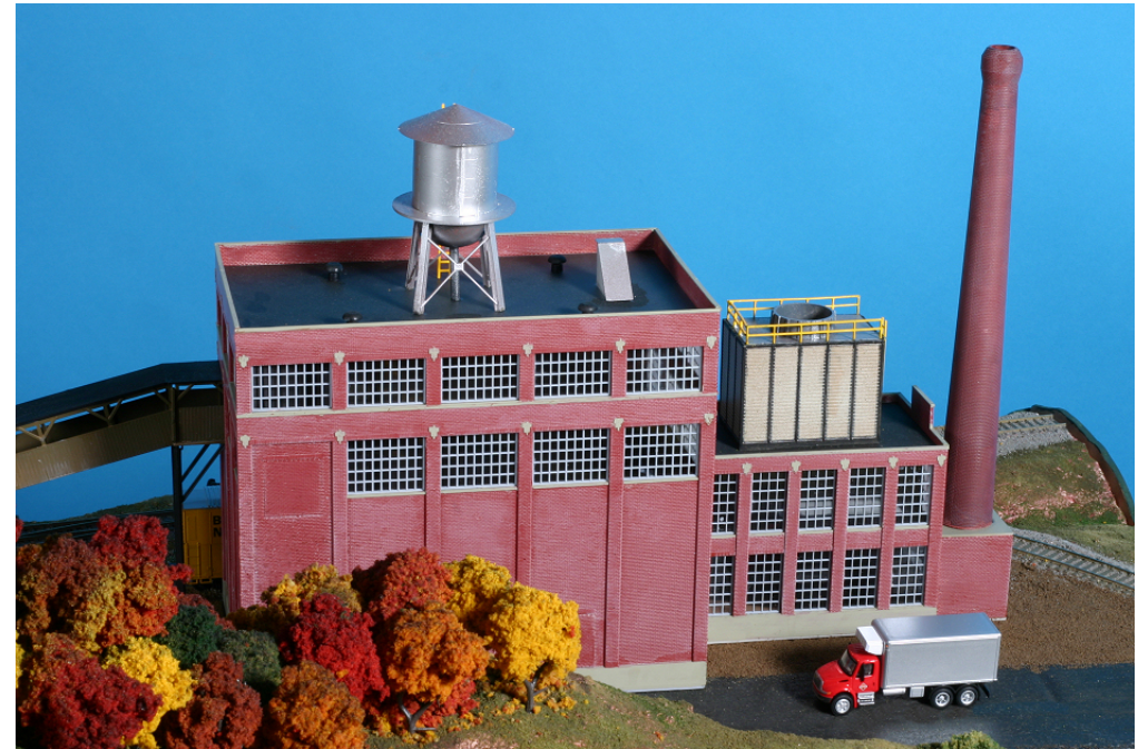
The backside of the packing plant.