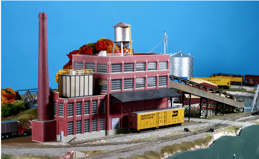
The major industry on the layout is this Walthers packing plant: stock cars in, refrigerator cars out.