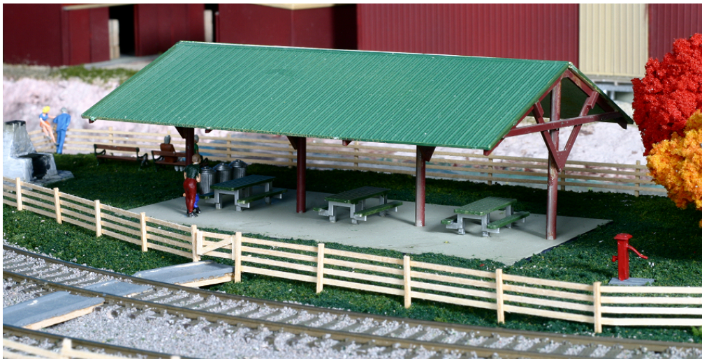
The picnic pavilion itself actually came from the Walthers lumber yard kit seen across the river in this shot.