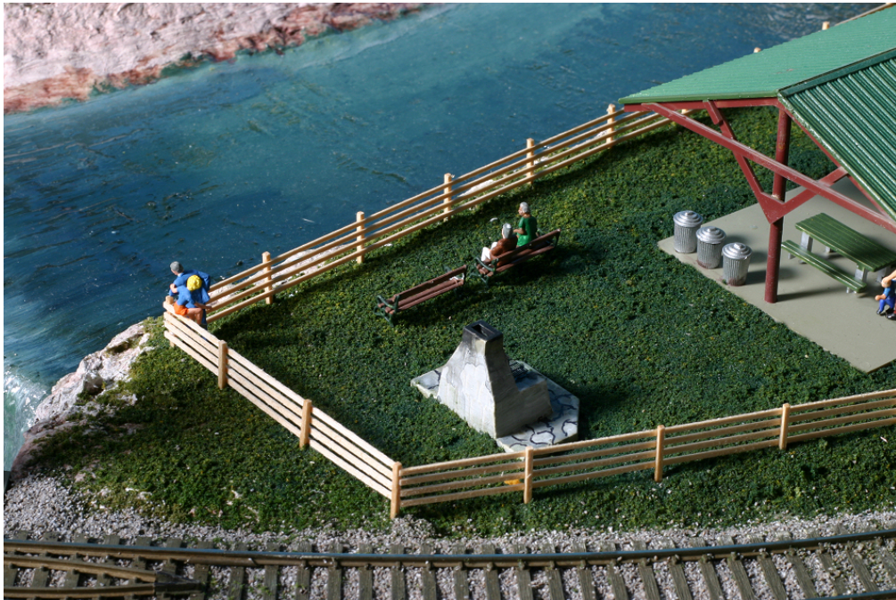
The Prieser picnics are perched on a Satke scratchbuilt fence.