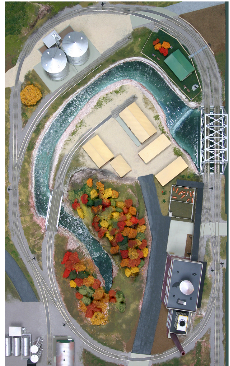
The Gateway Central XIII – Our 2006 Project Layout