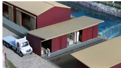
There's a lot of detail in the lumber yard scene. Various vehicles are by Lonestar, Boley, and Bush.