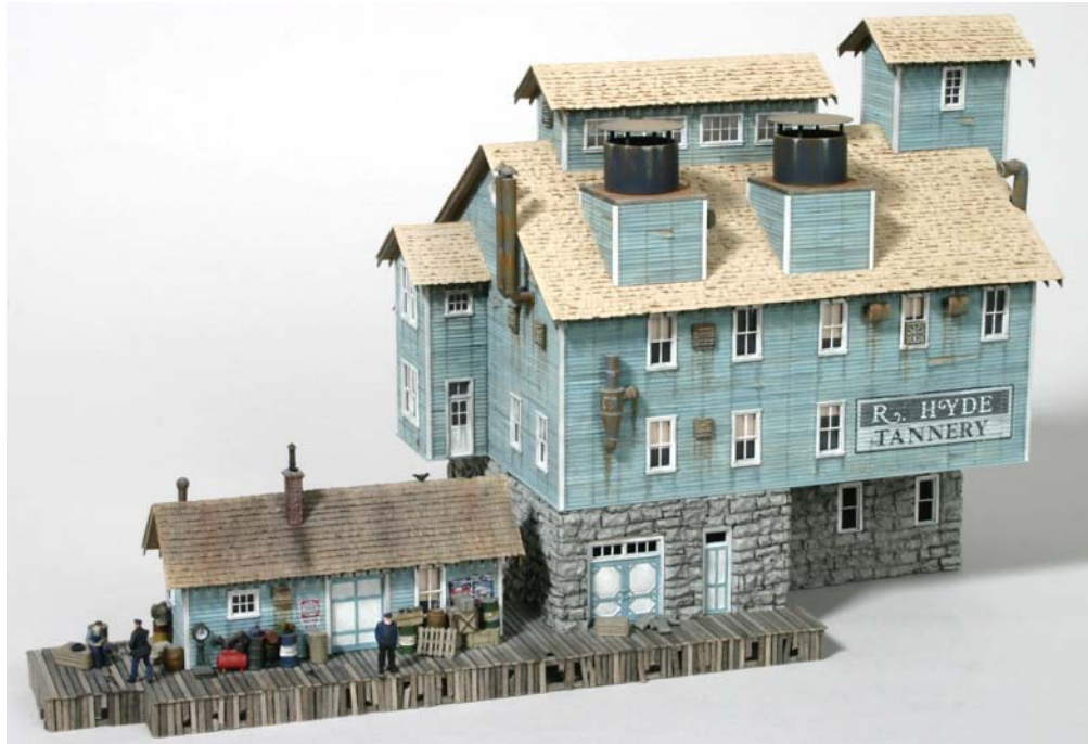
On-Line Structures, 3 rd Place, Jeffrey Boock