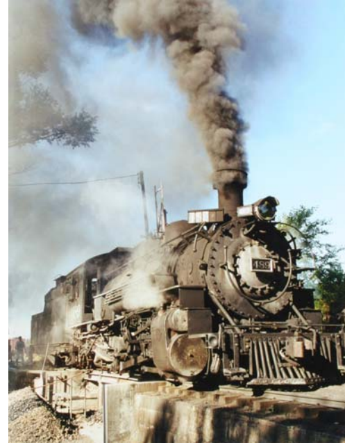
Color Prototype Photo, 1 st Place, Jeffrey Boock