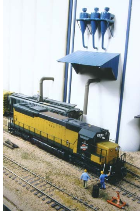
Color Model Photo, 3 rd Place, Al Warren