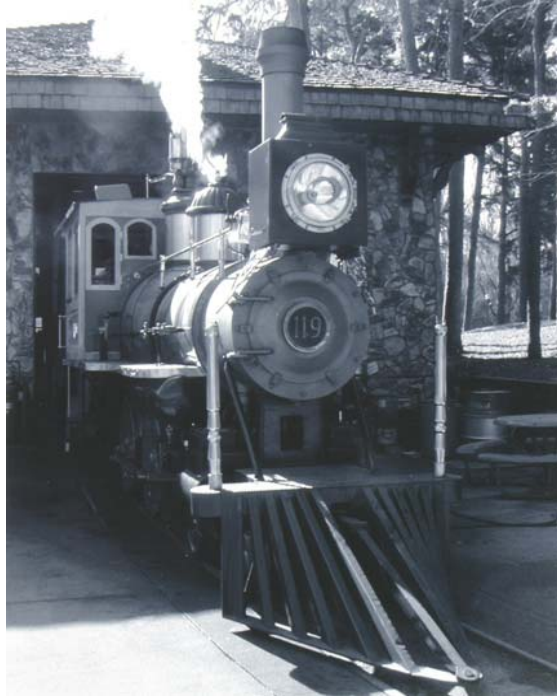
B&W Prototype Photo, 2 nd Place, Whit Johnson