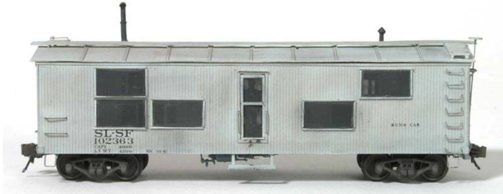
Non-Revenue Cars, 3 rd Place, Don Taschner