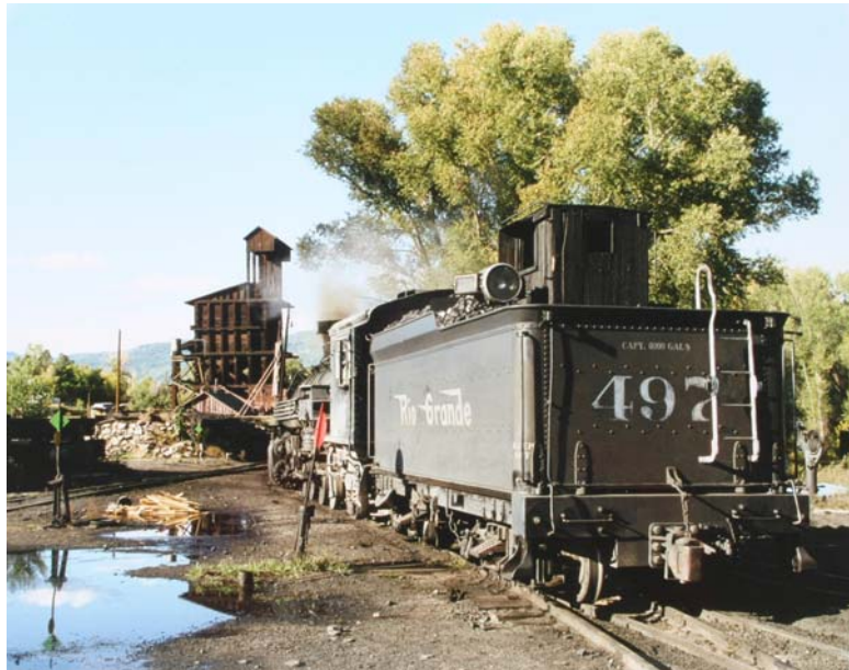
Color Prototype Photo, 3 rd Place, Jeffrey Boock