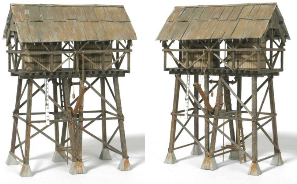
On-Line Structures, Honorable Mention, Don Taschner