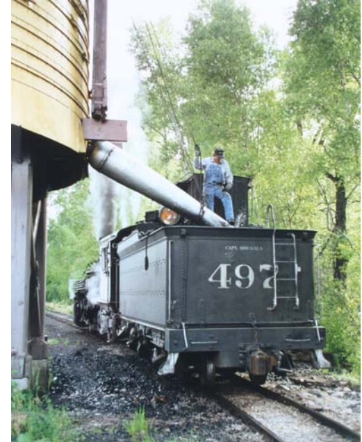
Color Prototype Photo, 2 nd Place, Jeffrey Boock