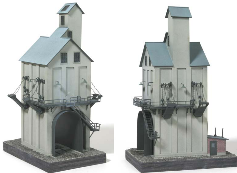
On-Line Structures, 2 nd Place, Brad Slone