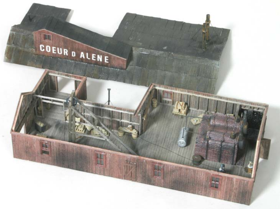
Off-Line Structures, 3 rd Place, Don Taschner