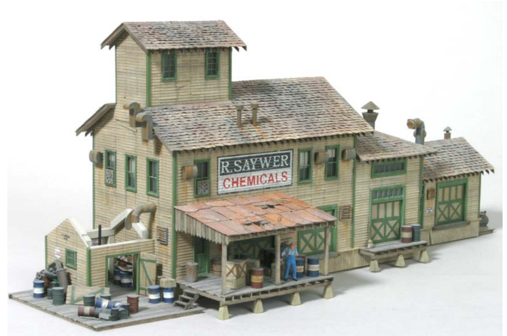
Off-Line Structures, 2 nd Place, Jeffrey Boock