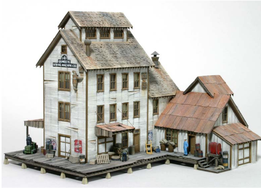
On-Line Structures, 1 st Place, Jeffrey Boock