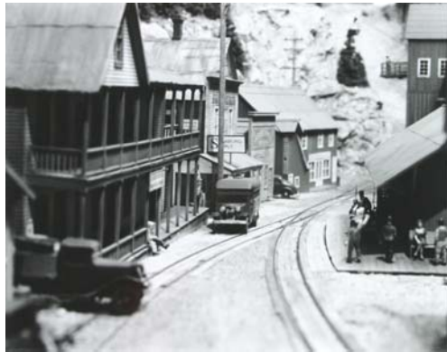
B&W Model Photo, 2 nd Place, Jeffrey Boock