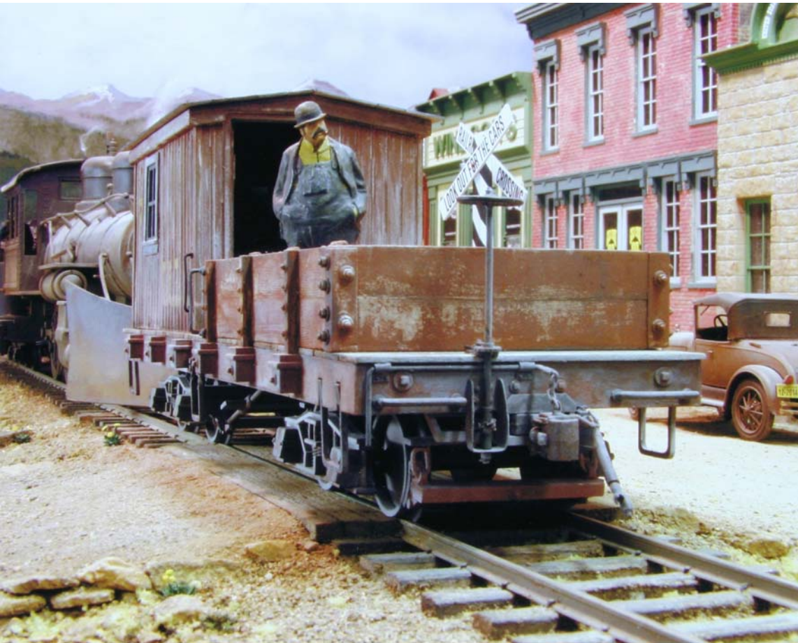
Gateway Getaway 2004 Regional Model and Photo Contest Winners