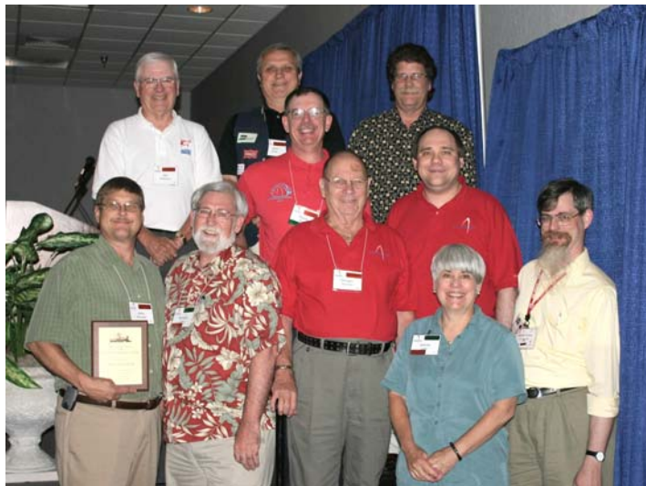
Chairs of the Gateway Getaway 2004 Regional Convention Committee, smiling at the end of the successful convention.

Some members of the Gateway Division will open their homes to tours on Saturday afternoon and evening, beginning around 4pm. Directions and information about these layouts will be available at the Fall Meet.