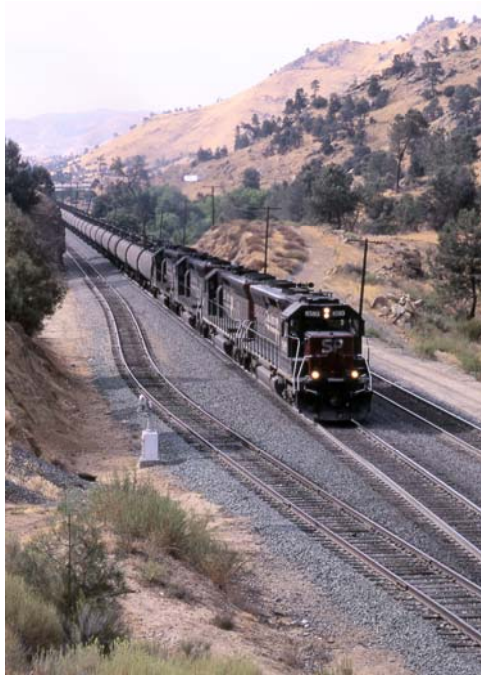
Prototype Color Slide First Place, Richard Schumacher