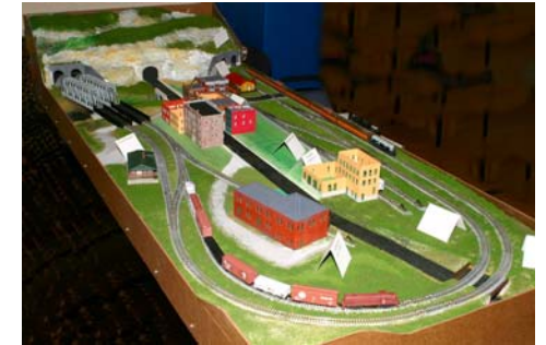
Gateway Central XI under construction and running at the Gateway Division 2003 Fall Meet.

layout represents the River Subdivision of the Burlington between Portage and Savannah, Illinois with its heavy traffic density.