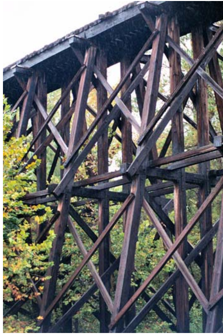
Prototype Color Print First Place, Venita Lake