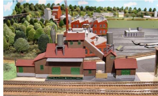
Model Color Slide (not available) First Place, Mike Thomas

Color versions of these model and photo contest photographs are available on the Gateway Division website: www.gatewaynmra.org/models03.htm